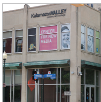
Center for New Media