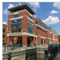
Kalamazoo Valley Museum