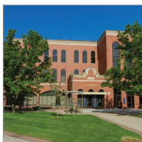
Anna Whitten Hall