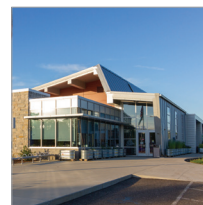
Food Innovation Center