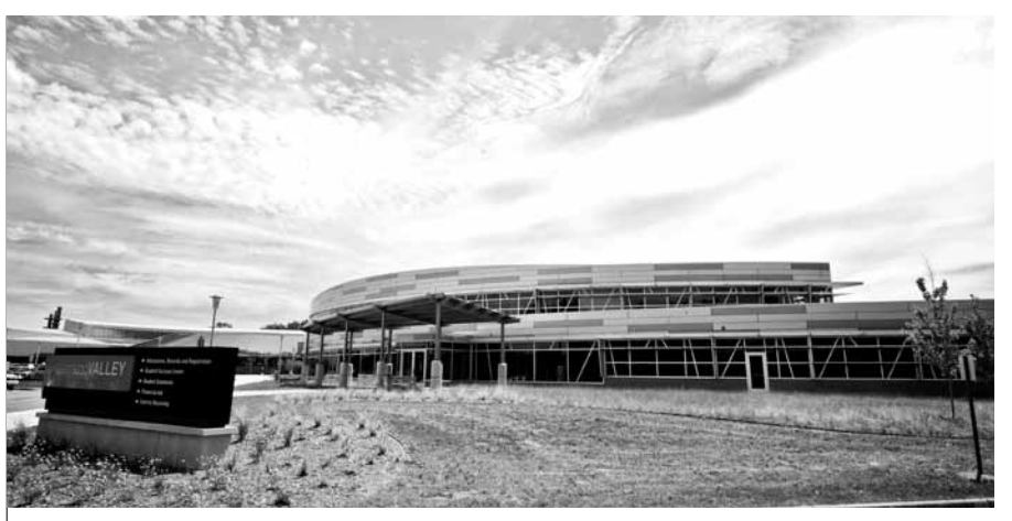
The new Student Success Center opened at KVCC's Texas Township Campus in November 2010. It was part of a $12-million renovation and expansion project that was the college's first major construction since the Student Commons was built in 2001.

Dive into forensic entomology, the use of insects such as flies, maggots and beetles, to reveal critical details of a crime scene a fascinating practice that plays a vital role in solving a variety of crimes. Visit Crime Scene Insects at the Kalamazoo Valley Museum through January 1, 2012.