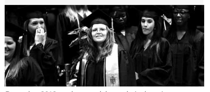
December 2012 graduates celebrate their alumni status.

Radisson Plaza Hotel & Suites, Downtown Kalamazoo Buy tickets at kvcc.edu/foundation or by calling 269.488.4442