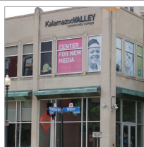
Center for New Media