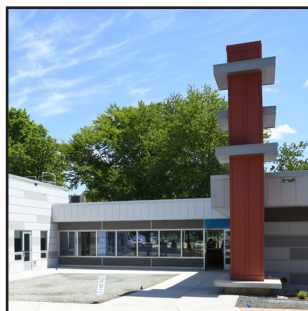
School of Cosmetology & Barbering