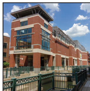
Kalamazoo Valley Museum