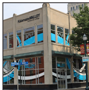
Center for New Media