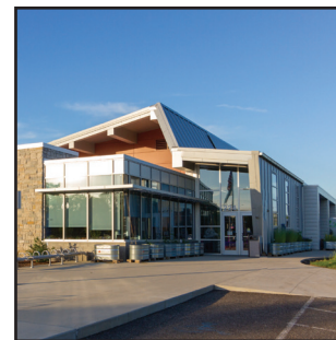
Food Innovation Center