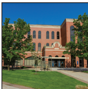
Anna Whitten Hall