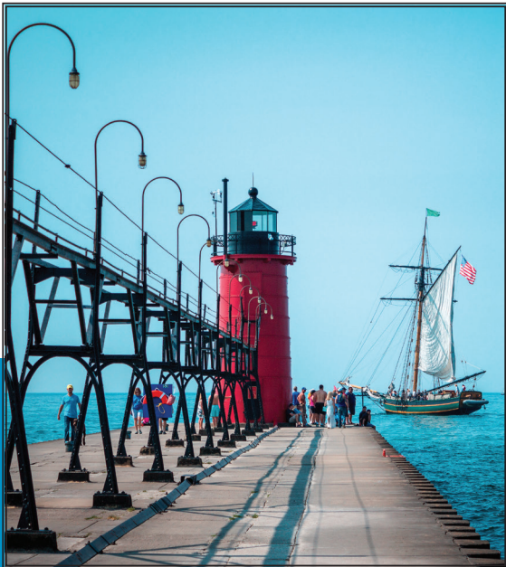
SOUTH HAVEN PIER